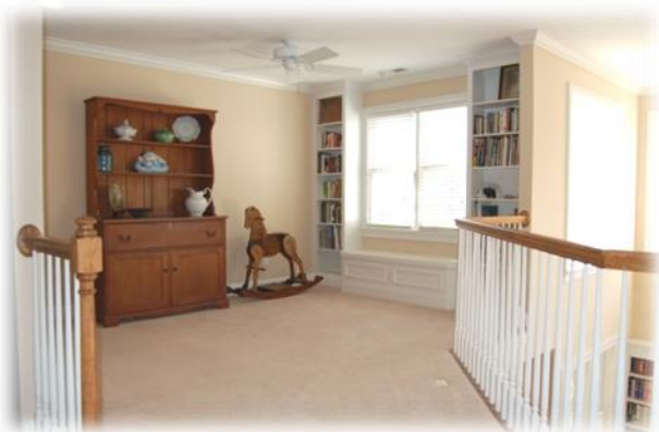
The open, spacious, bonus with window seat overlooking the Family room...