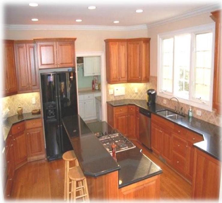
The fabulous gourmet Kitchen with granite counters and quality appliances...